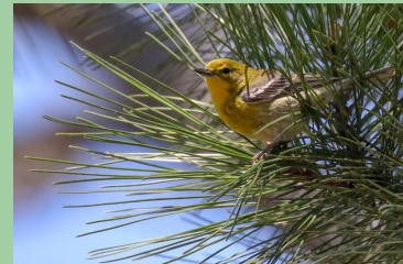
AuSable Bird Trail

The Quest Golf Club White Deer Country Club Snow Snake Ski and Golf Pine View Highlands